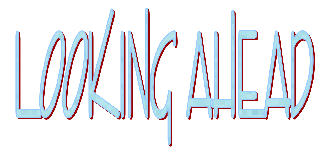
Issue 33 is due out on Saturday, 27<sup>th</sup> January 2007. Fancy having your say on a subject? Writing a review of an ADRIFT game? Have an article to publish?

Contributions to <a href="mailto:dwhyld@gmail.com">dwhyld@gmail.com</a> prior to the above date.